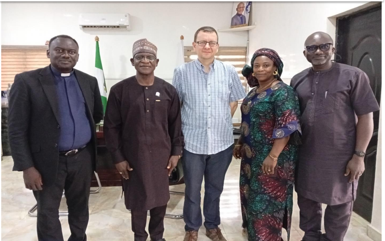
WITH GENERAL SECRETARY OF ECWA INTERNATIONAL