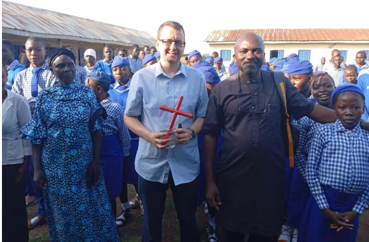
AT ECWA SEMINARY STAFF SCHOOL KAGORO