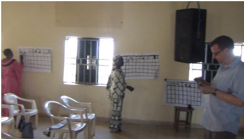
SKETCH BOARD TRAINING