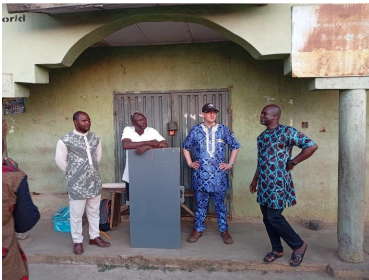
SKETCH BOARD IN ANOTHER AREA OF KAGORO