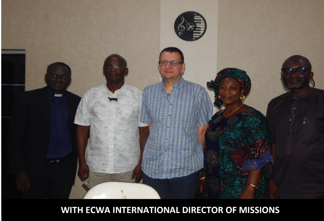
WITH ECWA INTERNATIONAL DIRECTOR OF MISSIONS