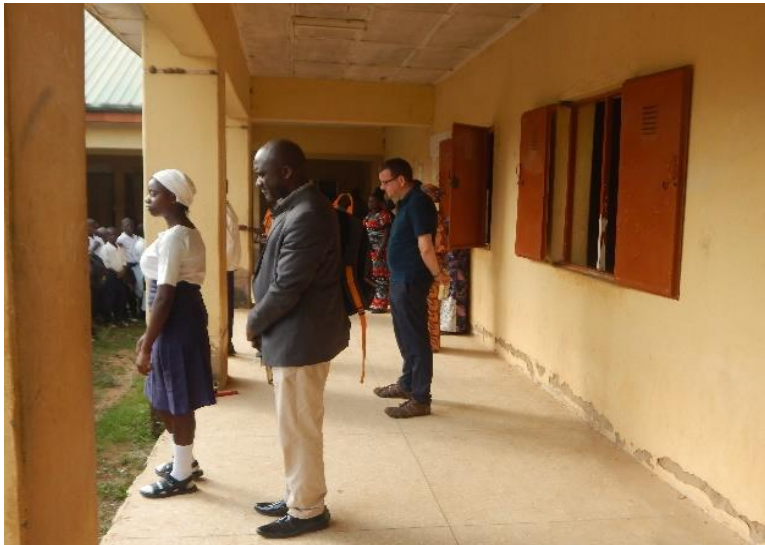
OUTREACH TO PUBLIC SCHOOL IN KAGORO