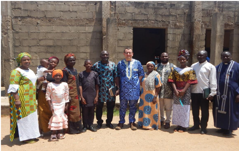
A group picture with members of evangelism team