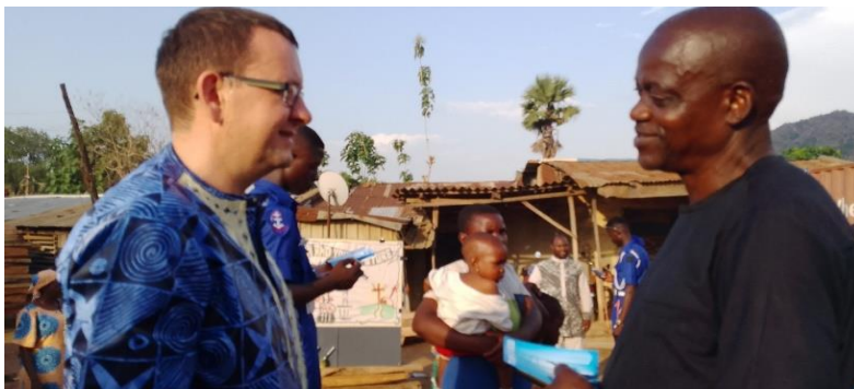
HARRIS DOING WHAT HE KNOWS BEST - EVANGELISM