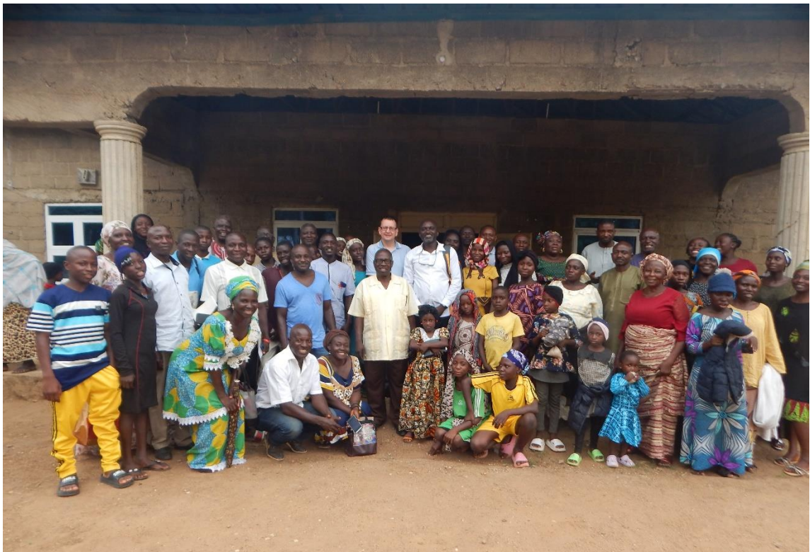
WITH CHURCH MEMBERS AFTER THE MID-WEEK WORSHIP PROGRAMME