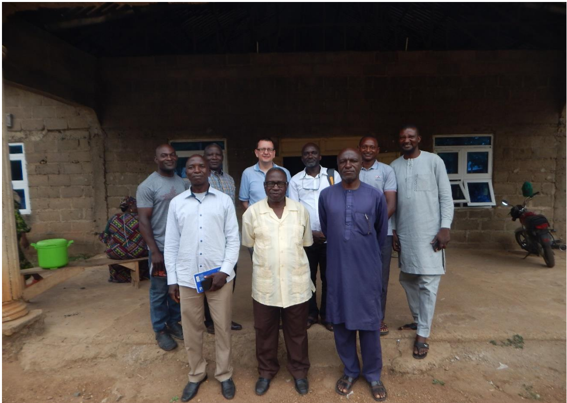
WITH ELDEERS OF THE CHURCH