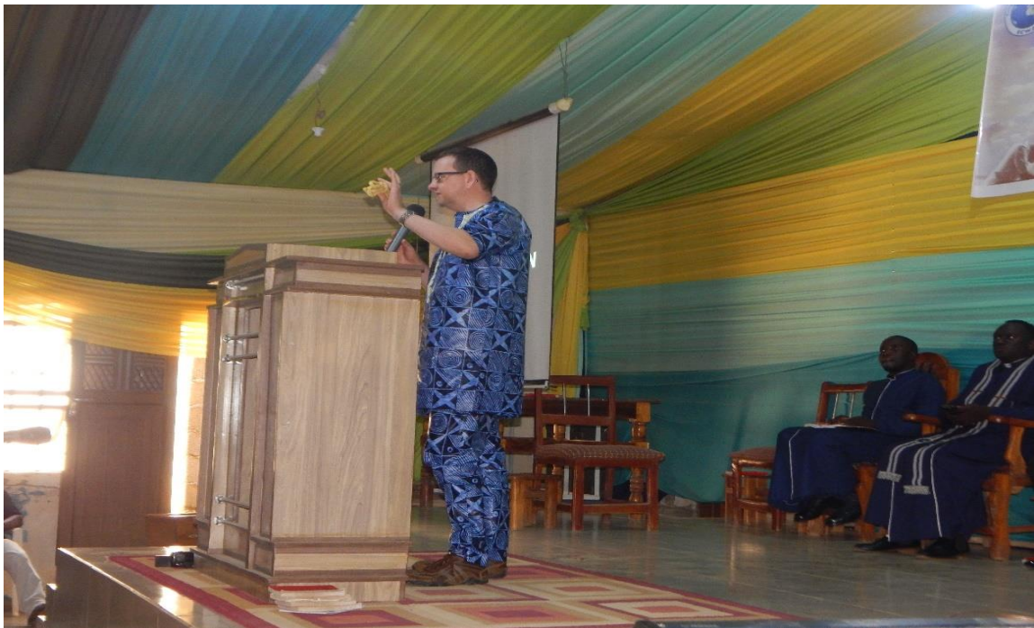
PREACHING AT ECWA CHURCH FADA KAGORO-NIGERIA