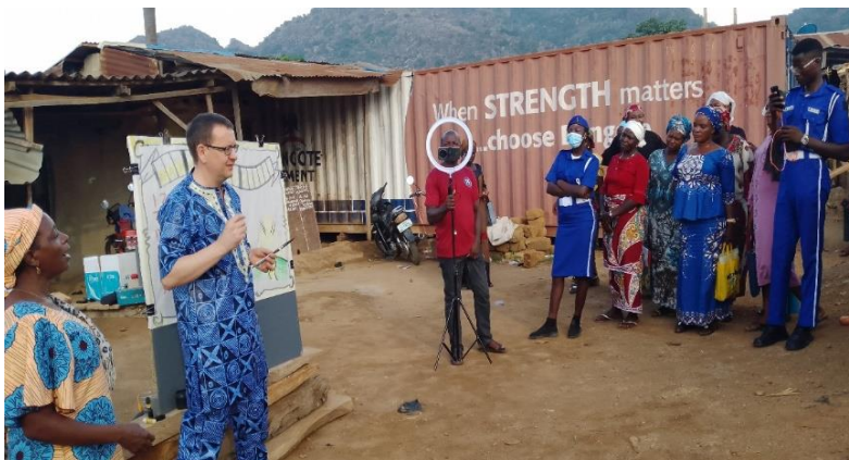
SKETCH BOARD EVANGELISM IN AN OPEN MARKET IN KAGORO-NIGERIA