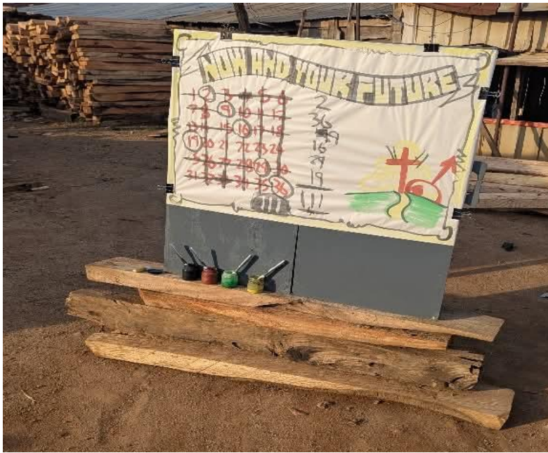
OPEN MARKET EVANGELISM SKETCH BOARD