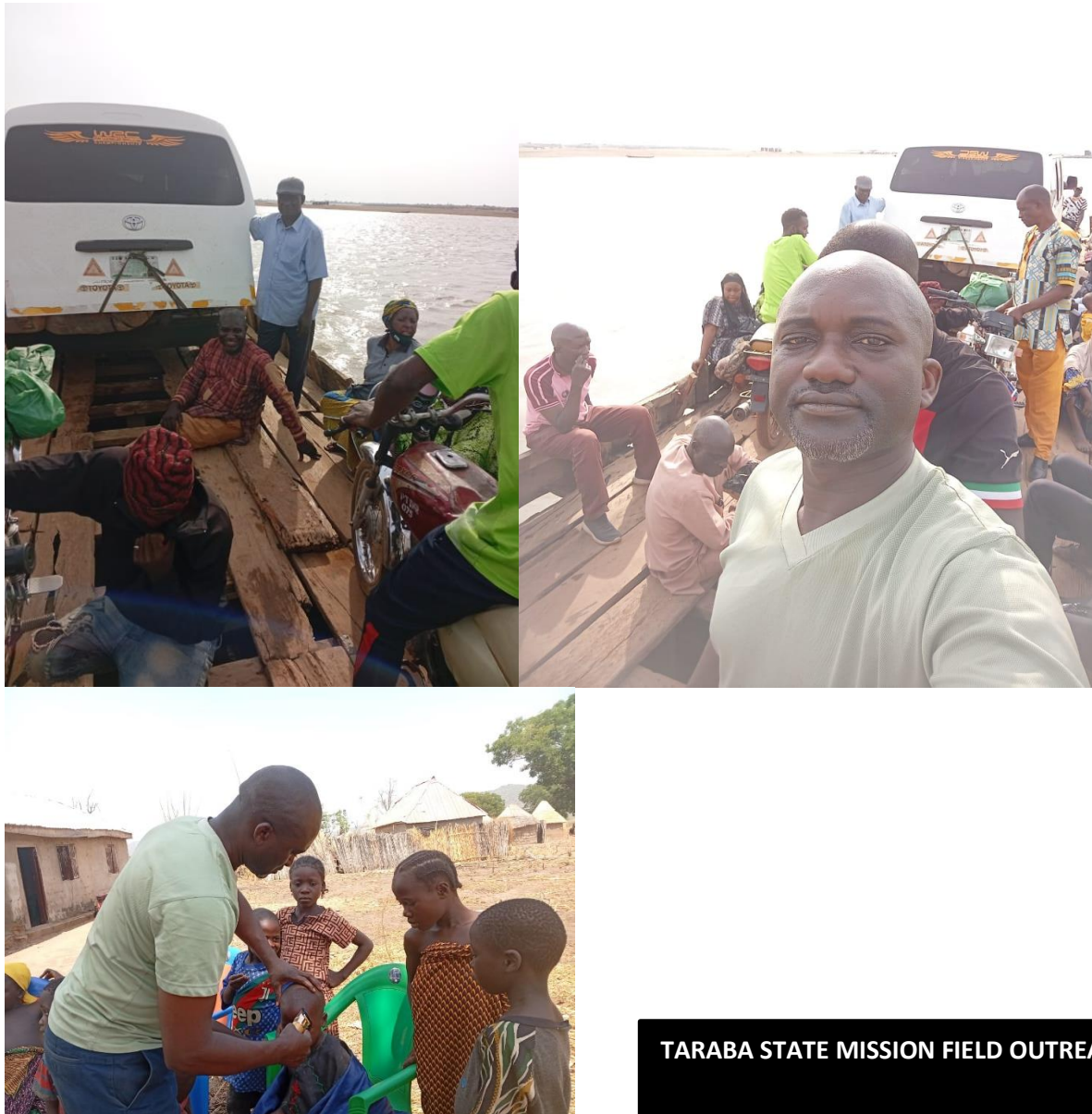
TARABA STATE MISSION FIELD OUTREACH